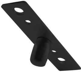
Bottom Patch Cut Out - KGT1055-AUTO100