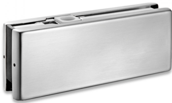
KGT200SS top patch fitting glass notch