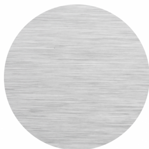
SATIN CHROME FINISH